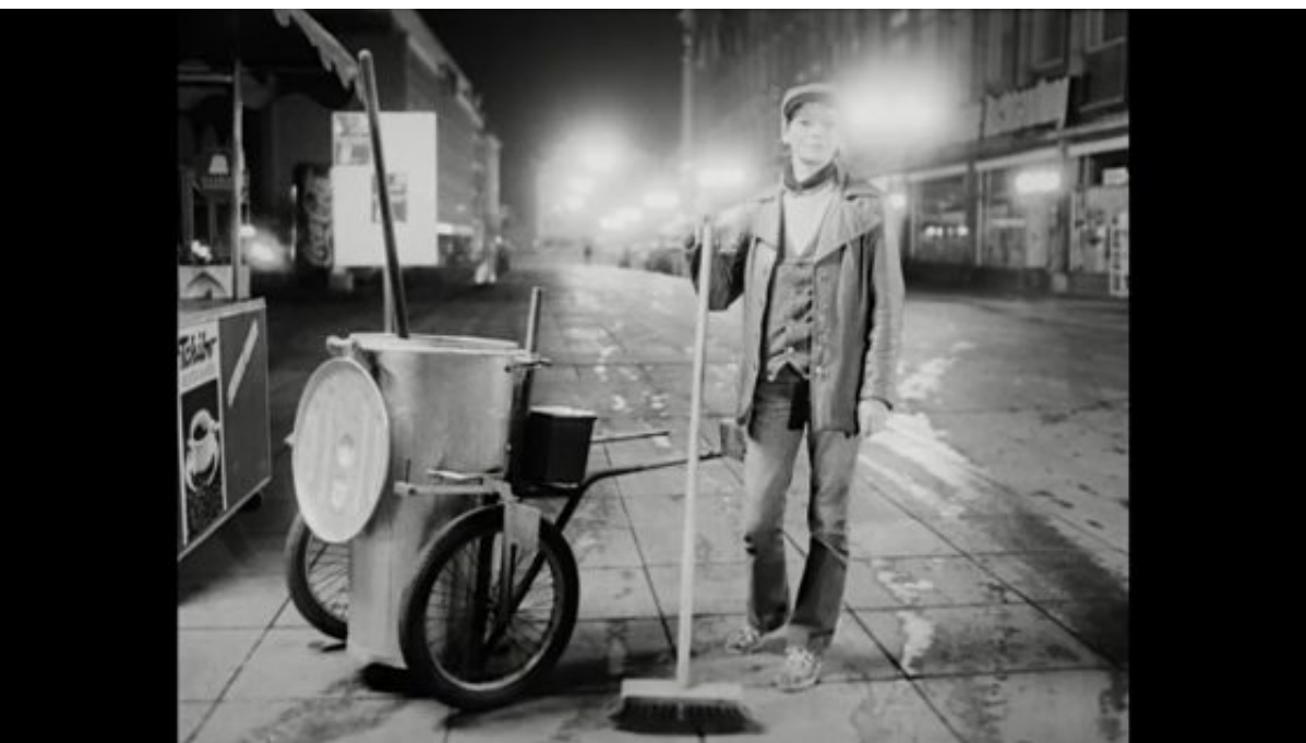
Figs 1, 2: Observant bystanders.